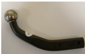
Bolt on 'fixed' Swan Neck

With swan necks the measurement to look for is the clearance from the centre of the towball to the nearest point of contact with the vehicle. This should be a minimum of 65mm (AKS 1300), 67mm (AKS2004), 68mm(AKS3004), 60mm (AKS2700)