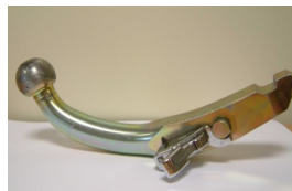
Detachable Swan Neck