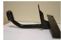
Bolt on 'fixed' Swan Neck